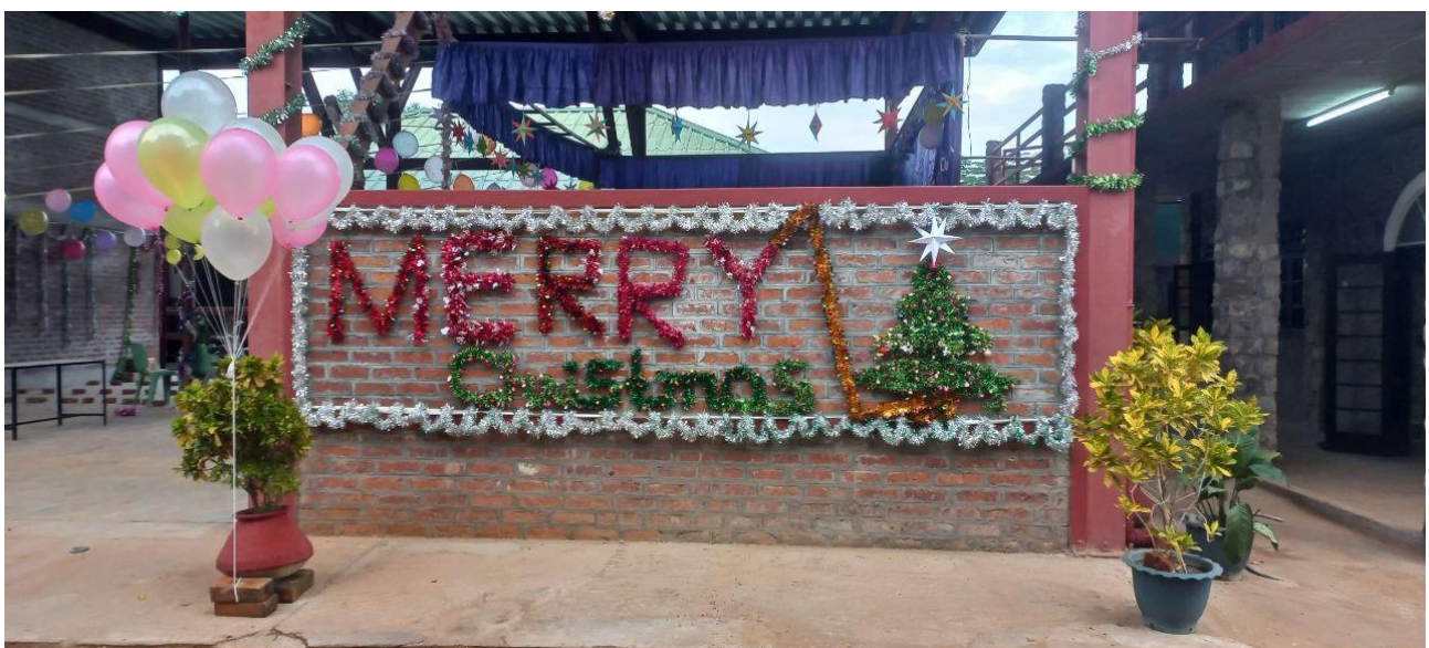
A festive atmosphere!