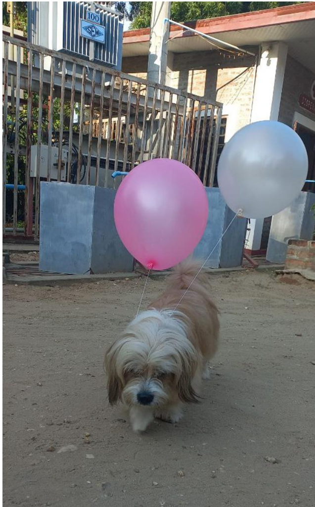
Zoe's dog Jack happily took part in the Celebration