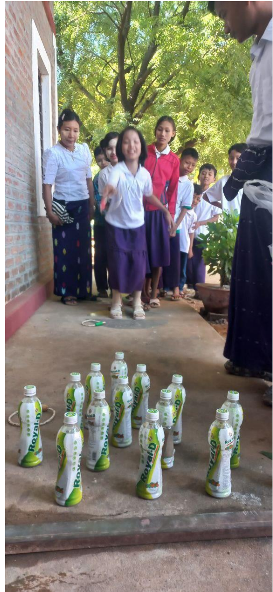
Lots of games were part of the fun....